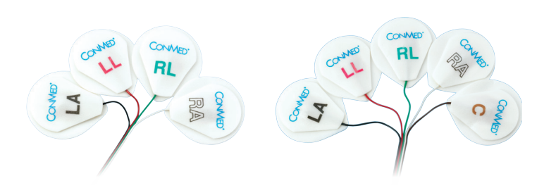
4 Lead 38-404-1