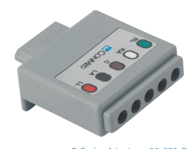
R Series Adapter – 38-620-R

Note: the use of this adapter requires a five lead backpad cable.