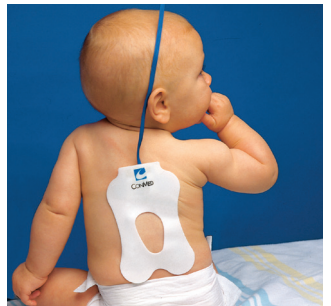
Infant Backpad 01-4130